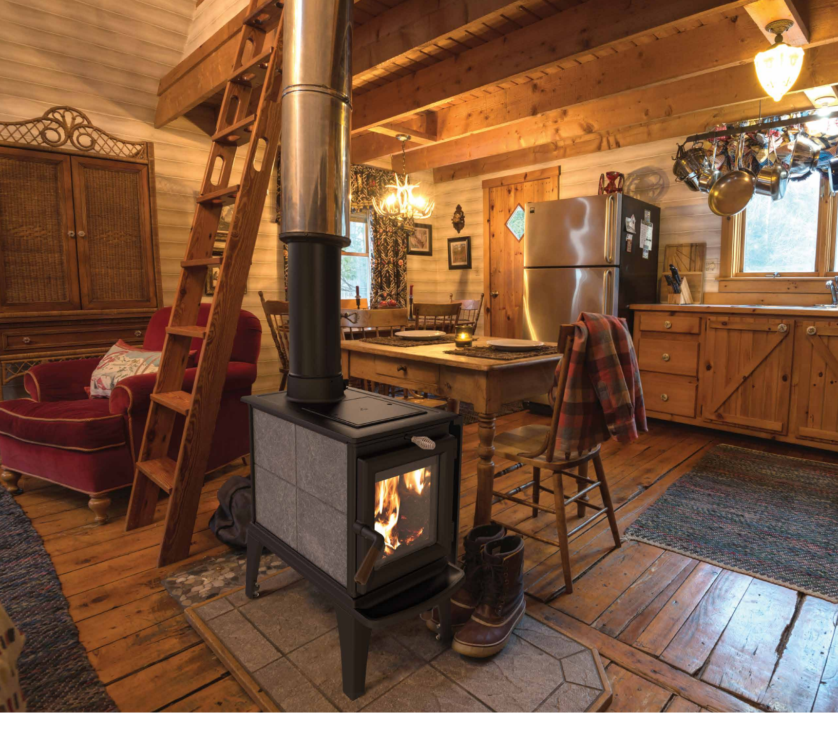
The Lincoln 8060 Wood Burning Stove