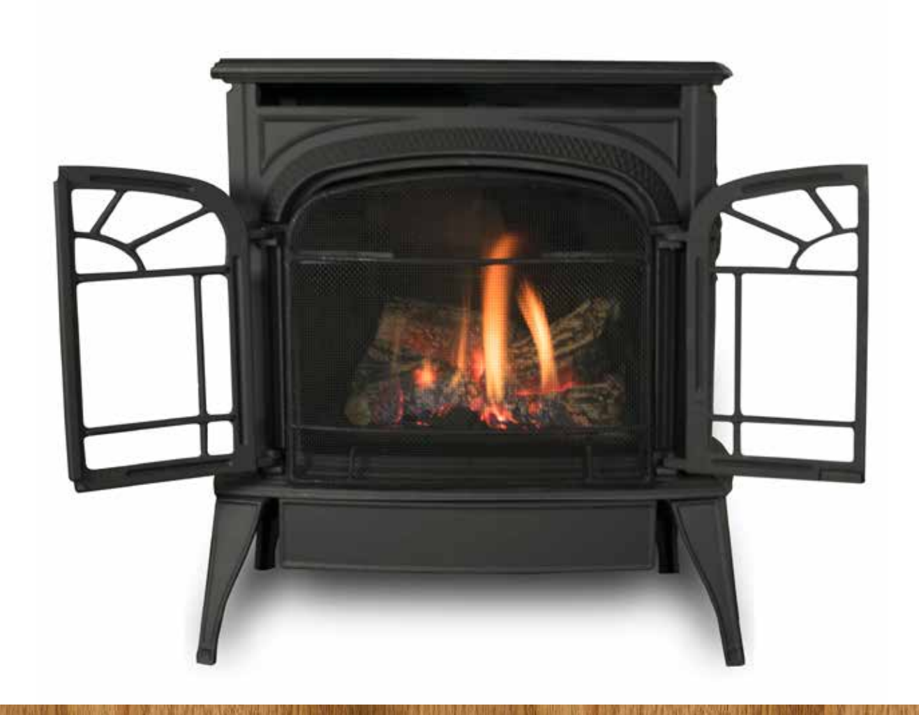
Intrepid® Direct Vent Stove in Classic Black