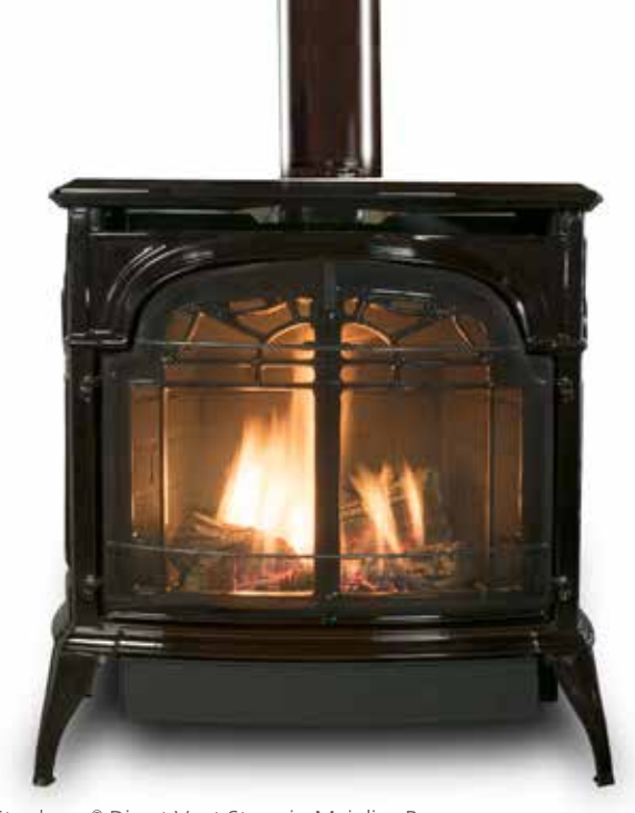
Stardance® Direct Vent Stove in Majolica Brown

Add an optional fan kit to efficiently move heat around your room. The variable speed, heat activated fan maximizes the 18,5000 BTUs of heat generated by the Intrepid®.