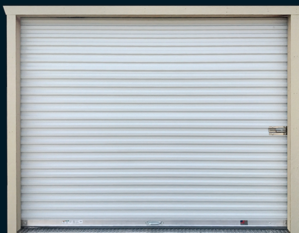
6' Roll-up Garage Door 9' Roll-up Garage Door