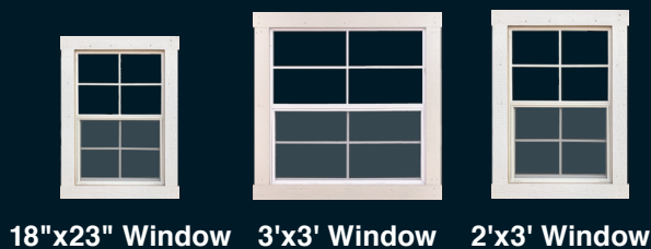
18"x23" Window 3'x3' Window 2'x3' Window